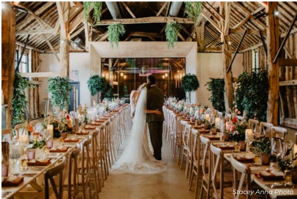
Stacey Anna Photo